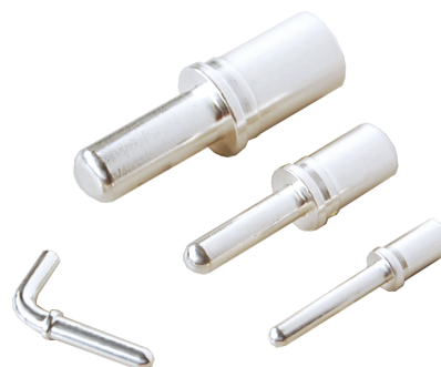
Plug pins (silver plating)