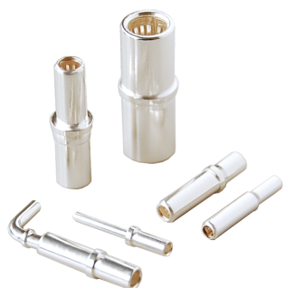
Socket pins (silver plating)